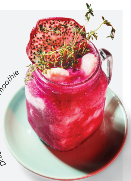
Dragonfruit Lychee Smoothie