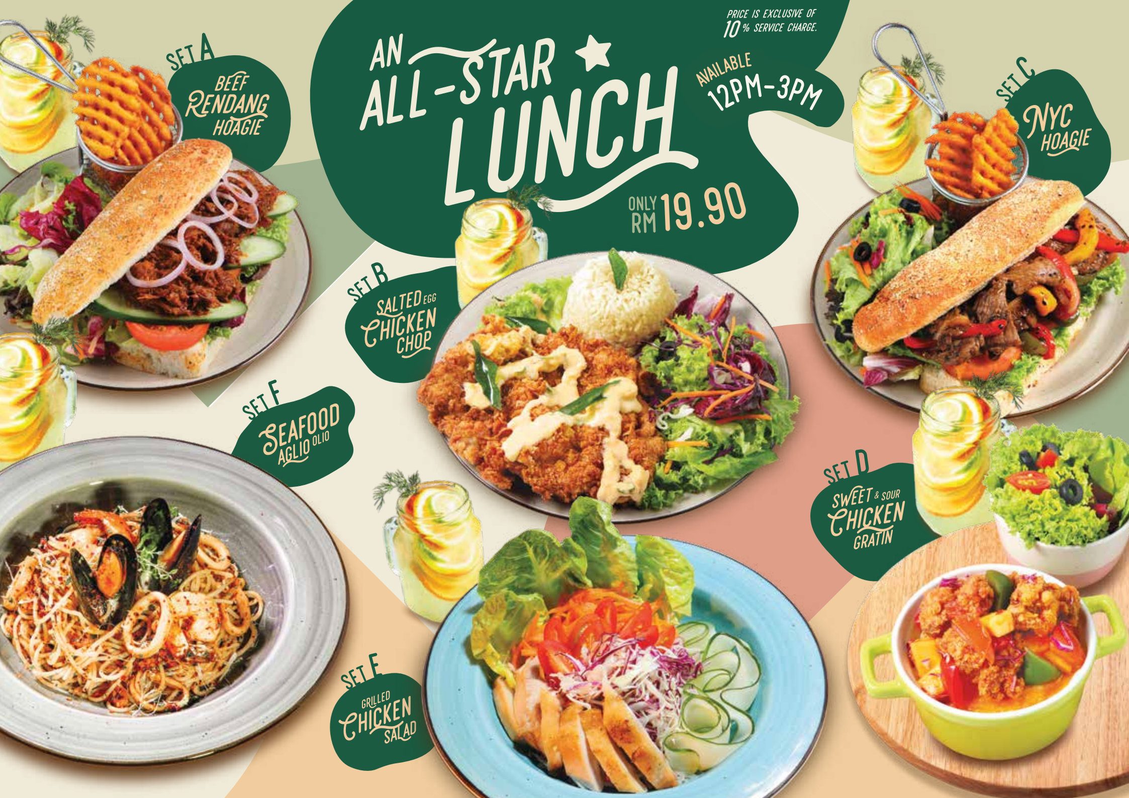
SET A BEEF RENDANG HOAGIE