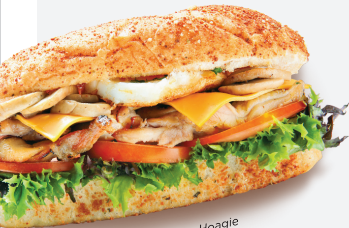
The Ultimate Hoagie