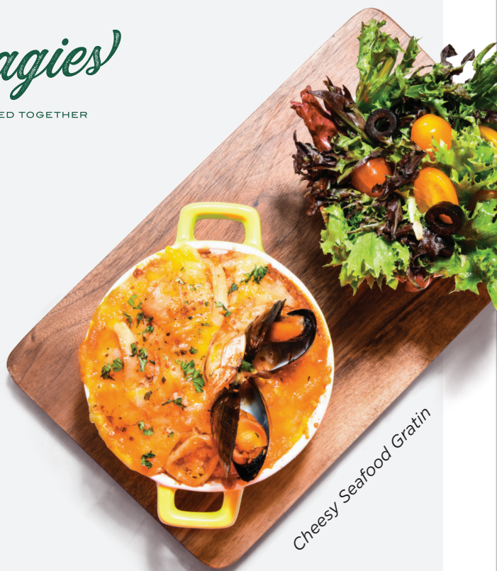
Cheesy Seafood Gratin