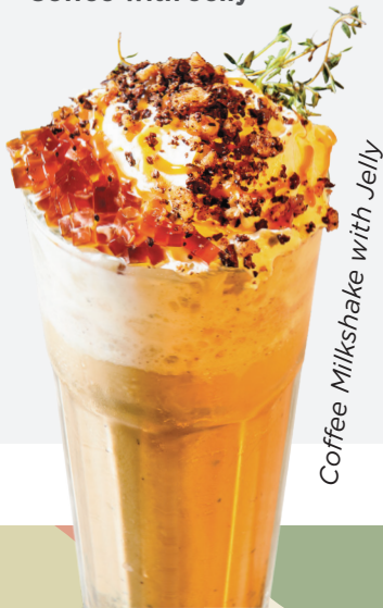
Coffee Milkshake with Jelly