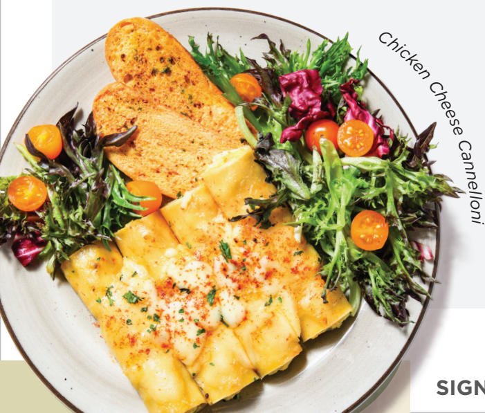
Chicken Cheese Cannelloni